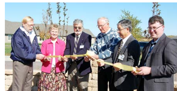
Ribbon Cutting Bethany Meadows Memory Garden October 20