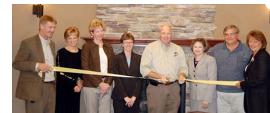
Mixer/ Ribbon Cutting Town & Country Realtors October 16