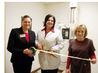
Ribbon Cutting (New X-ray Machine!) Brandon Natural Care Center January 12th