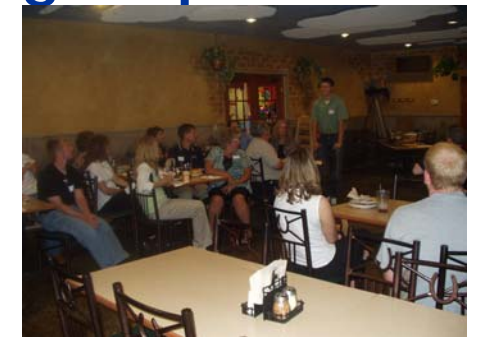
New Member Luncheon - July 23

On the Brandon Golf Course deck was perfect weather, beautiful scenery and great food provided by our hosts that made this a wonderful mixer. Members had a great time visiting and learning more about one of our gold members, SEH.