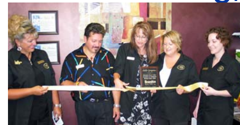
Hello Gorgeous ribbon cutting - July 11