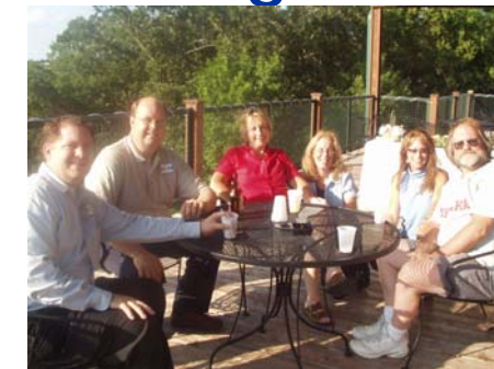
Short Elliott Hendrickson (SEH) Mixer - July 17

On the Brandon Golf Course deck was perfect weather, beautiful scenery and great food provided by our hosts that made this a wonderful mixer. Members had a great time visiting and learning more about one of our gold members, SEH.