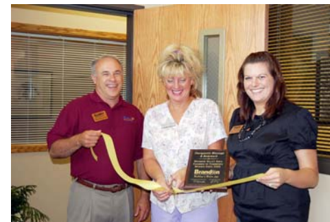
Therapeutic Massage & Bodywork ribbon cutting - July 29th