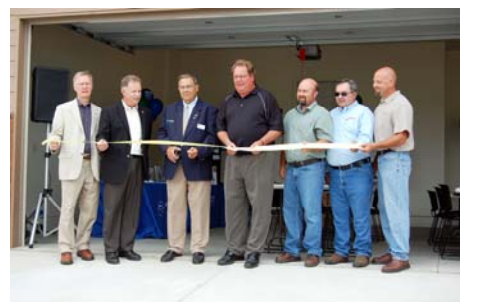
Sioux Valley Energy E2 House ribbon cutting - August 11